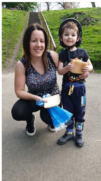
At the park feeding the ducks.